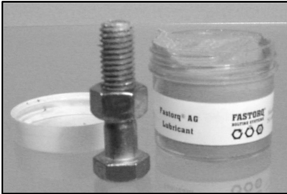
Nut goes entire length of bolt thread without seizing.

The compound was rubbed on the last three to five threads of the bolt's point end and the nut was started on the bolt. As would be expected, as soon as the nut encountered the bolt's thread nicks the torque required to rotate the nut immediately increased. What was not expected was that the nut could be screwed the full length of the bolt thread without the threads seizing together as a result of galling.