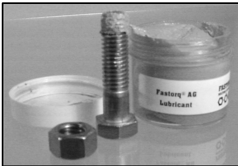
Anti-galling compound placed on bolt's end threads.

The threads of a 1/2-13 302 stainless steel bolt were severely damaged by striking them repeatedly with a hammer. It was reasonable to assume that a 302 stainless steel nut would not go on this bolt without completely seizing on the bolt's thread due to thread galling.